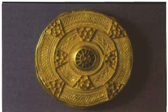
Figure 2 General view of the 'Scheibensibel' of Lauchheim. Magnification: ca natural size