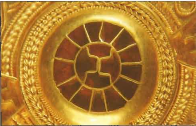
Figure 4 The central dome or 'cloisonné', polished copper-free Au-Ag alloy; inside is the copper oxide film on the base plate, left for decorative purposes to generate the image of almandine or garnets Magnification: ca x 2