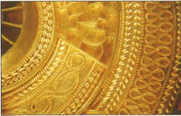
Figure 3 Detail of the cloisonné and filigree work on the Lauchheim fibula; the various decorations were all made with twisted metal wires and strips Magnification: ca x 2